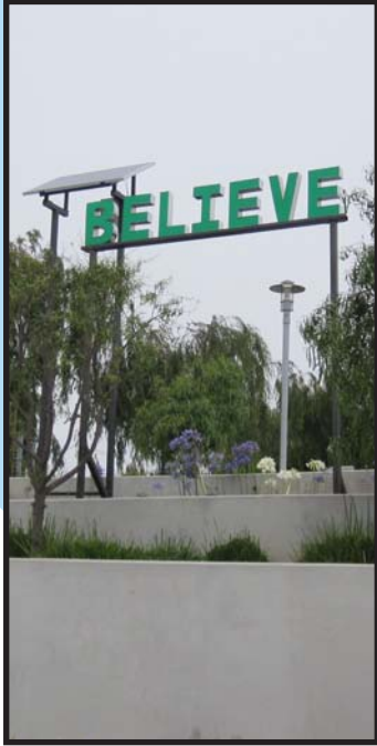
Believe, Green Artist: Jason Manley

Jason Manley's artwork explores relationships between language, space, and objects. For the Manhattan Beach Sculpture Garden, he proposes "Believe, Green," which was inspired by the multitude of electric marquees that shape the Los Angeles skyline. This work reinterprets commercial signage as a platform to deliver a poetic message intended to inspire individual thought and reflection. The open-ended command "believe" invites the viewer to interpret and complete its meaning, and the glowing green lights are illuminated by solar panels promoting awareness to green technology and clean energy.