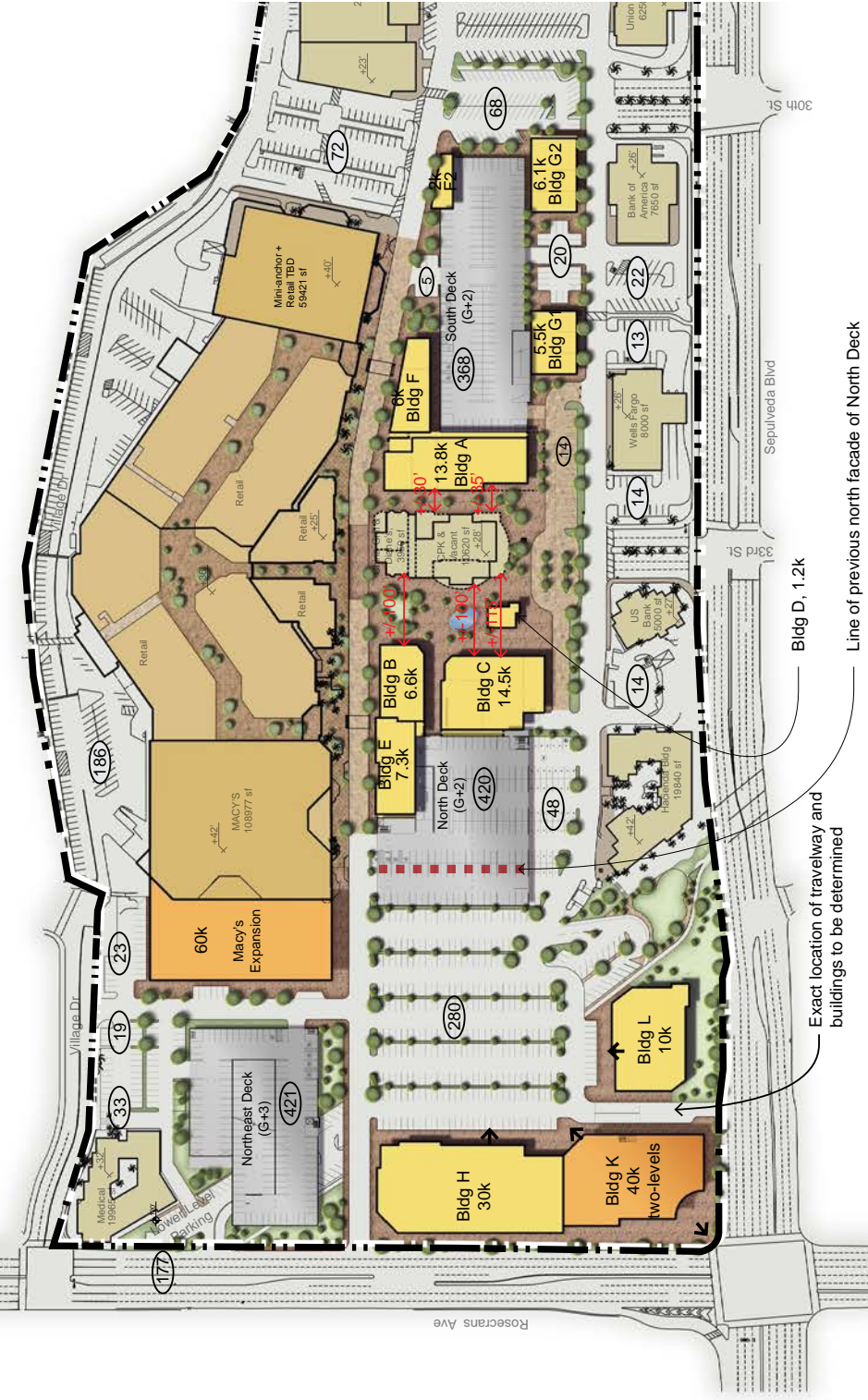
2008 Concept Plan 2013 New Concept Plan