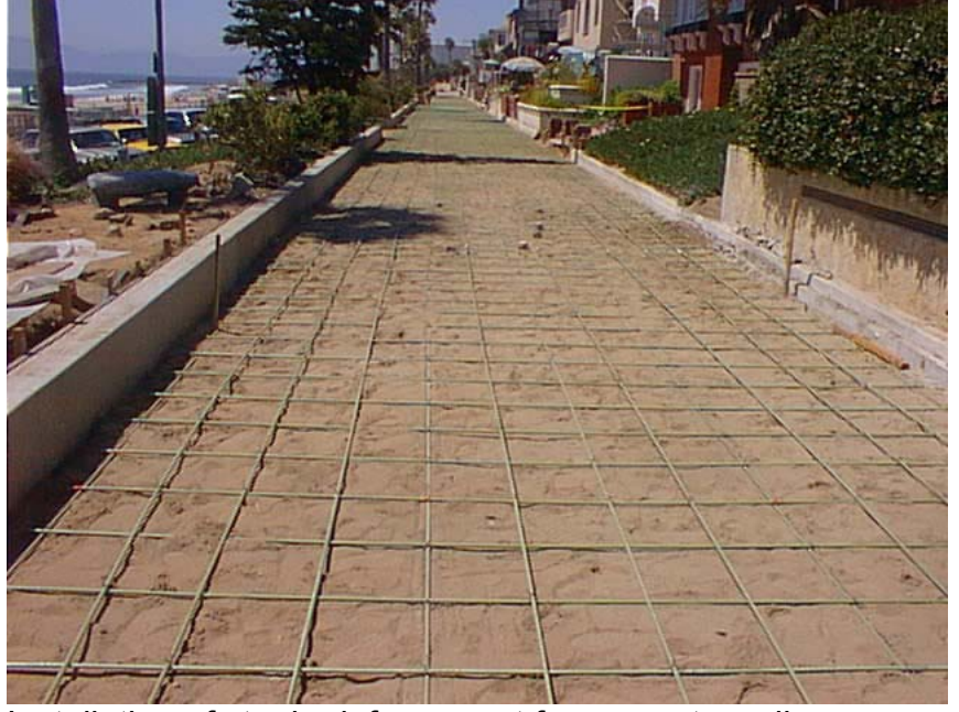
Installation of steel reinforcement for concrete walkway