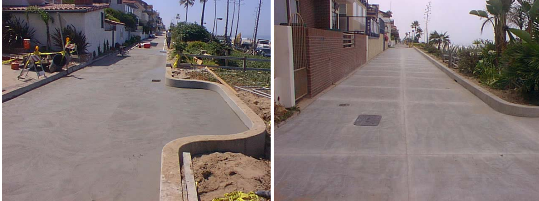
Completed concrete walkway with bench alcove