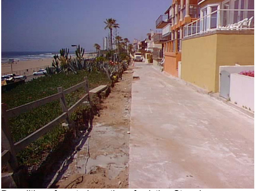
Demolition of westerly portion of existing Strand