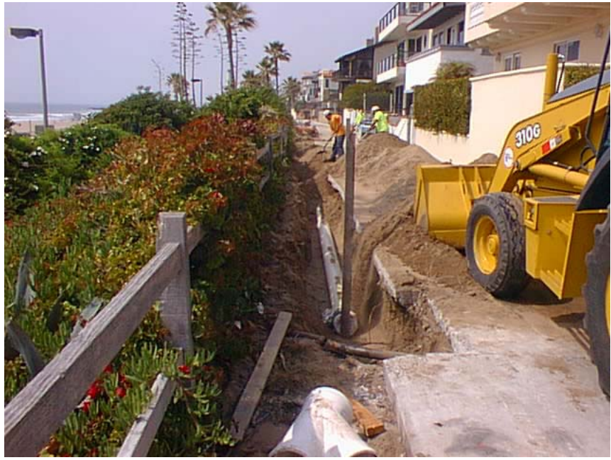
Installation of storm drain pipe