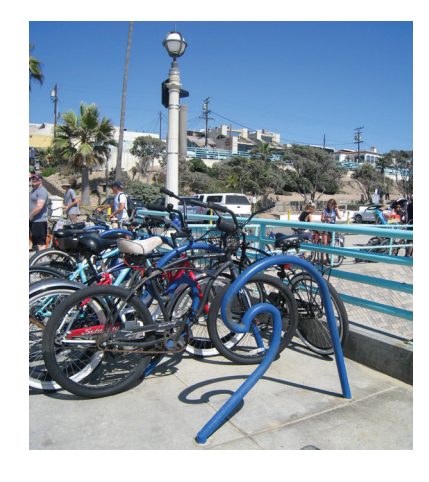
Figures 3.8-3.13 Enhance pedestrian and bicycle access