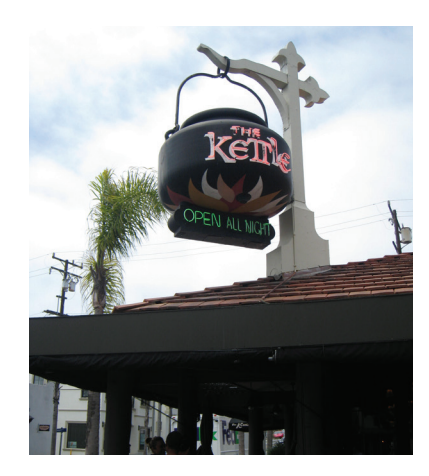
Figures 3.2-3.7 Downtown's small town character