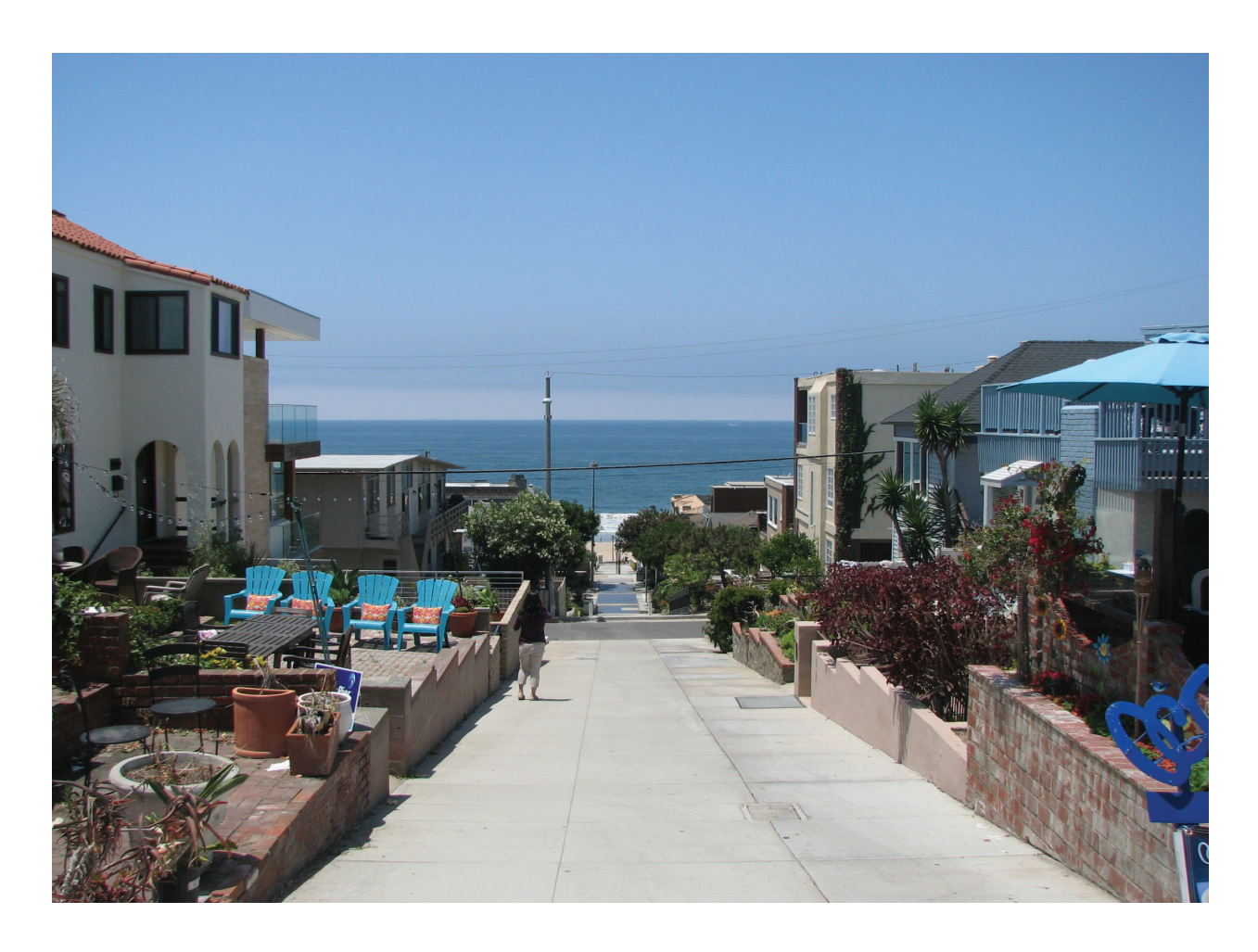
Figure 3.1 Much of the charm of Manhattan Beach is defined by the large number of walk streets