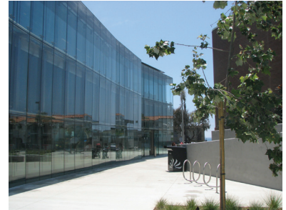
Figures 8.4-8.6 Recently opened library (top and middle) and Roundhouse Aquarium at the pier (bottom)

The project area does not include any cultural facilities, and the Specific Plan does not anticipate any such facilities being constructed in the district. Several facilities within close proximity do serve the district. This includes the Roundhouse Aquarium, located on the Pier, several buildings located in Live Oak Park: the Annex, Joslyn Community Center, Live Oak Park Recreation Center, and the Scout House, and two buildings located adjacent to the park: the Downtown post office and the Chamber of Commerce.