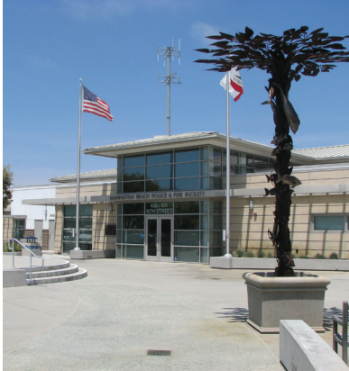
Figure 8.3 The Police & Fire Facility

The Specific Plan does not propose any additional recreation and park spaces in the project area.