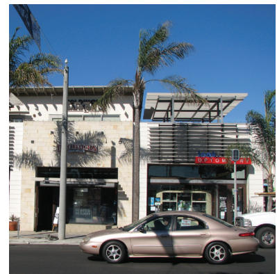
Figure 6.15 Balconies and roof gardens activate stepback areas