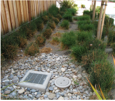
Figure 6.33 Vegetated bioswale filters stormwater