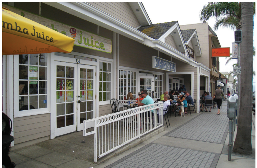
Figures 6.36-6.41 Outdoor dining arrangements