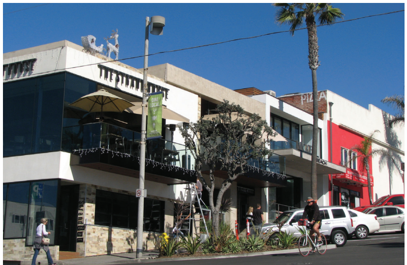
Figures 6.1-6.6 Existing Downtown development