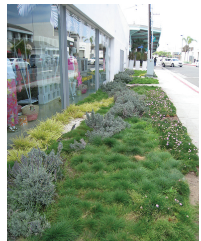
Figure 6.32 Landscaped character complements adjacent architecture