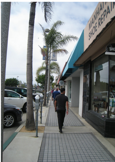
Figure 6.9 Buildings are located at the property line