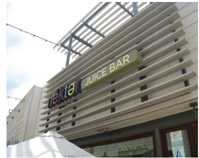
Figures 6.34-6.35 Signage should be high-quality, pedestrian-oriented, and compatible with the building style