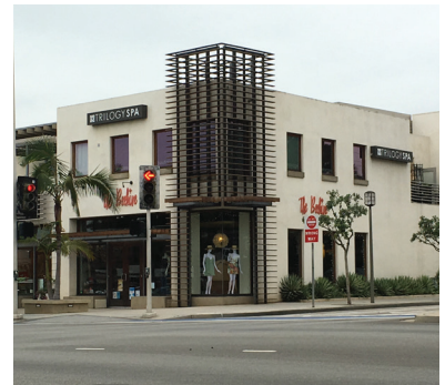
Figure 6.10 Corner entrance emphasized through unique articulation and materials