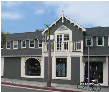
Figure 6.16 Detailed architectural treatments enhance the facade