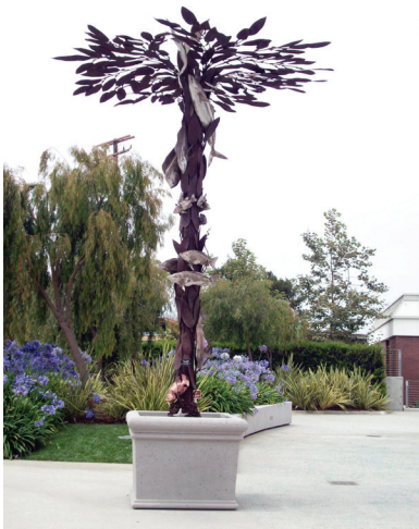
Figures 6.42-6.43 Sculpture garden artwork