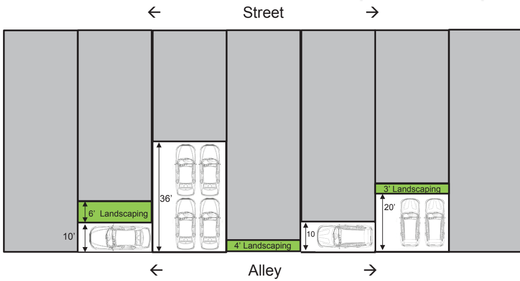
Figure 6.8 Minimum Rear Yard Setback - CD Zone (on alleys)

All properties shown above conform to the rear yard setback requirement.