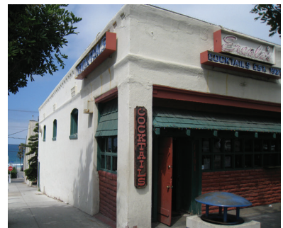
Figure 6.25 1101 Manhattan Ave is the oldest commercial building in the Downtown

Downtown Manhattan Beach’s buildings incorporate a variety of architectural styles, inspiring the district with an eclectic identity. To perpetuate the project area’s architectural variety, development should seek to preserve historic structures. In addition to the City’s Historical Preservation Code, the following guidelines should be considered, where feasible, in the alteration of historic buildings and construction of new buildings and additions adjacent to such resources. For information pertaining to voluntary historic preservation regulations, refer to the Manhattan Beach Municipal Code - Historic Preservation Code Section 10.86 and A.86 of the Local Coastal Program (pending final Coastal Commission Approval).