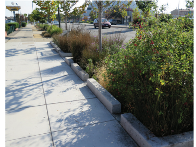
Figures 6.45-6.46 Planting strips and bioswales help reduce and filter stormwater