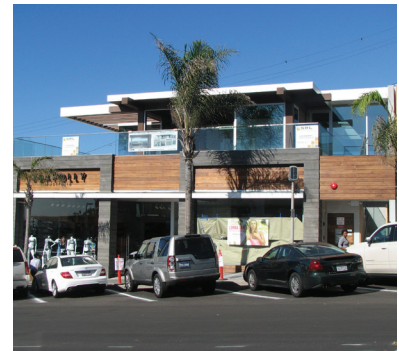
Figure 6.14 Upper story steps back