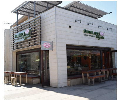
Figure 6.18 Mix of high-quality building materials