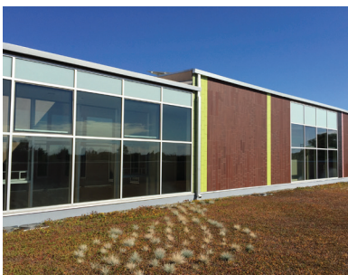
Figure 6.44 Green roofs absorb heat and rainwater