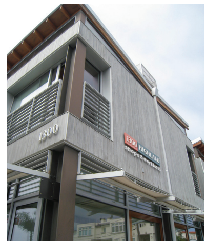
Figure 6.19 A variety of materials, colors, and textures creates visual interest