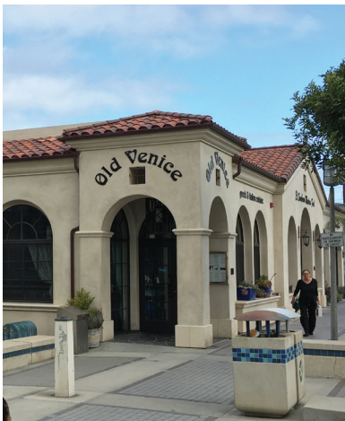
Figure 6.12 Inviting corner entrance with tower feature

Downtown Manhattan Beach is predominantly composed of compact blocks and narrow parcels that mostly occupy limited street frontage. The massing and scale of Downtown’s existing buildings reflect these dimensions, contributing to the area’s vibrant, pedestrian-oriented streetscape. Building heights range from one to three stories and building setbacks are limited. The Downtown contains a number of finely detailed buildings in a variety of styles which contribute to the area’s unique quality and help define its pedestrian scale. To complement the project area’s massing, scale, and character; new development should consider the following guidelines.