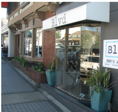
Figure 6.17 Transparent windows along ground-floor retail