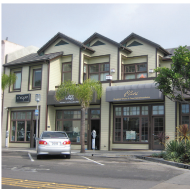
Figure 6.13 Building mass has been broken into smaller forms