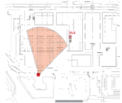
VIEW LOOKING EAST @ NORTH PARKING DECK FROM SIDEWALK OUTSIDE HACIENDA COURTYARD