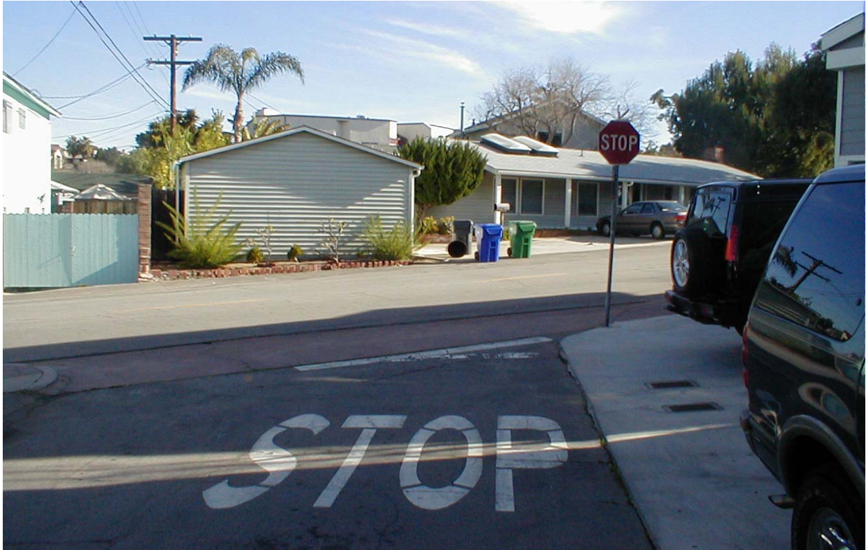
21 st Place at Blanche Road Looking East