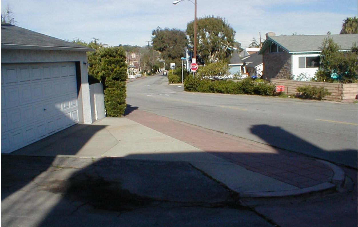
21 st Place at Blanche Road Looking Northbound