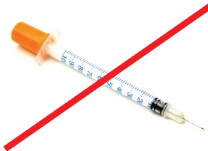
NO Needles Agujas