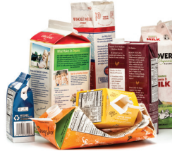
Food & Beverage Cartons Cartones de alimentos y bebidas