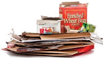
Flattened Cardboard & Paperboard Cartón y cartulina aplastados