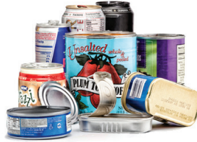
Food & Beverage Cans Latas de alimentos y bebidas