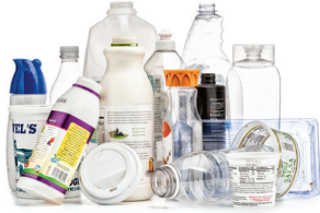
Plastic Bottles & Containers Botellas y envases de plástico