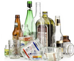
Glass Bottles & Jars Botellas y jarras de vidrio