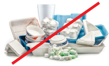
NO Foam Cups & Containers (Check Earth911.org for options.) Vasos y contenedores de poliestireno (Vea opciones en Earth911.org .)