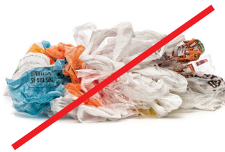
NO Plastic Bags & Film (Find a recycling site at plasticfilmrecycling.org .)