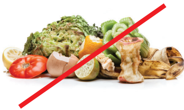
NO Food Waste (Compost instead!) Residuos de comidas (¡úselos para compostaje!)