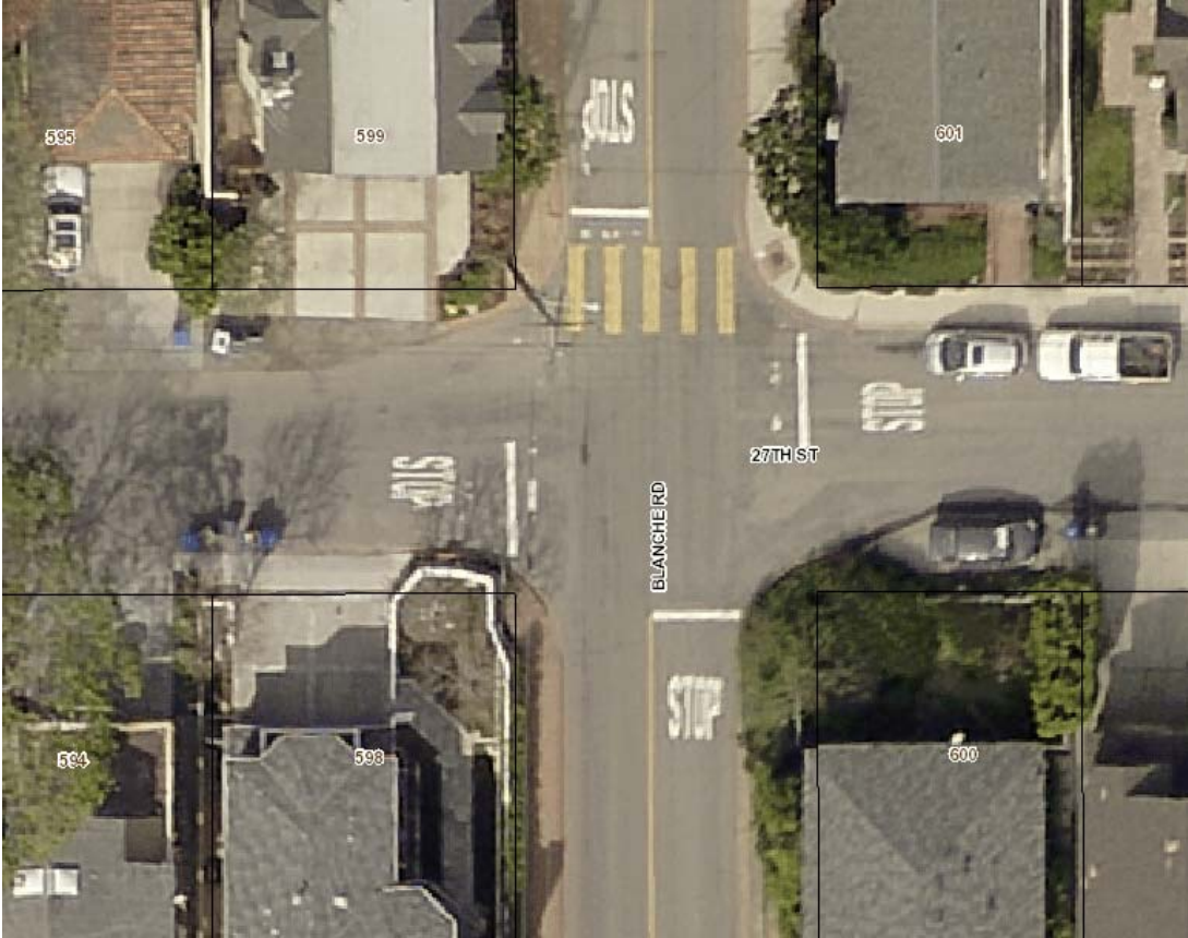
EXHIBIT 2 Aerial Photo and Location Map