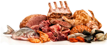
Meat Bones, shells, fish, beef & chicken