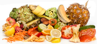
Produce Fruits & vegetables