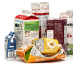
Food & Beverage Cartons