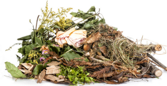
Yard Waste Grass, leaves & branches (3" diameter or smaller)