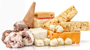
Dairy Eggs, yogurt & cheese