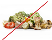
NO Food Waste