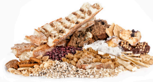
Bakery & Dry Goods Pasta, beans, rice, bread & cereal