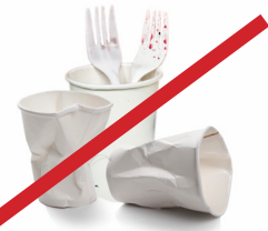
Waxed Paper Cups & Plastic Utensils (including biodegradable/compostable)