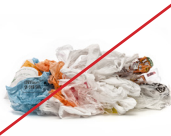
NO Plastic Bags & Film