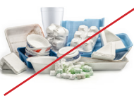
NO Foam Cups & Containers