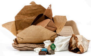
Food-Soiled Paper Coffee filters, tea bags, napkins and paper plates