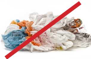
Plastic Bags or Containers (of any kind); no Bio Bags