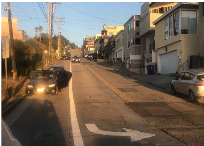
45 th Street Looking East 4:45pm