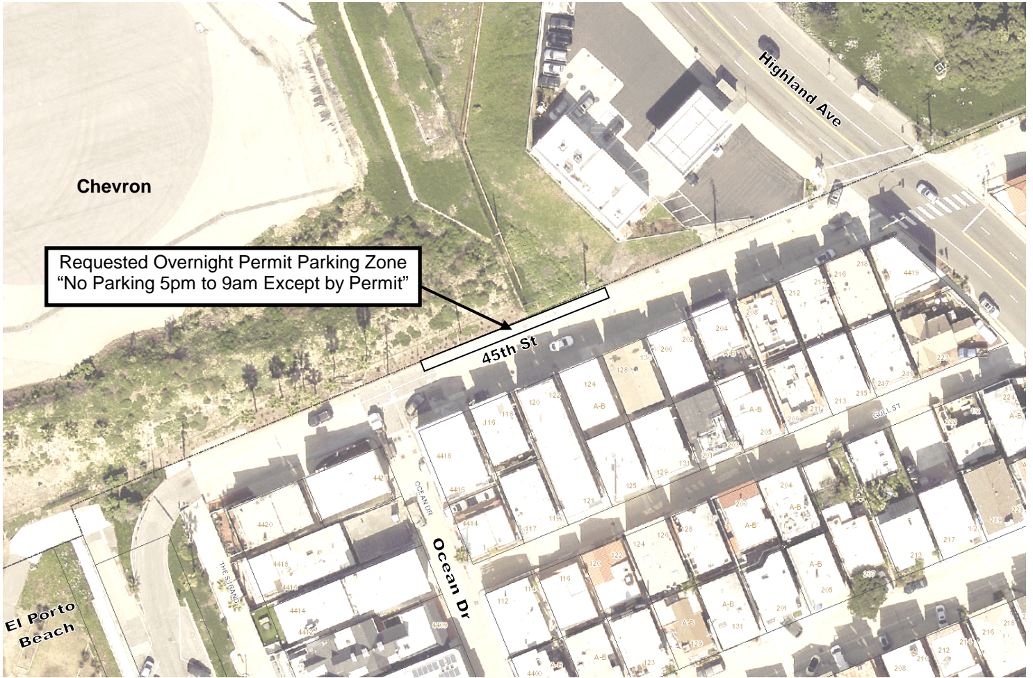
EXHIBIT 3 45 th Street Overnight Permit Parking Restrictions Aerial Image and Site Photos