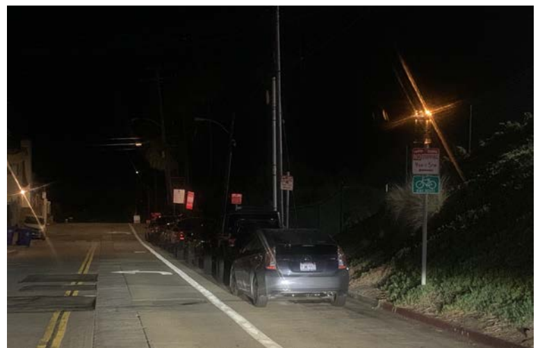
45 th Street Looking West 9:00pm