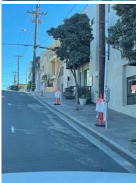
9th Street heading east