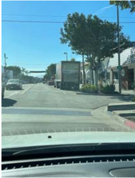
Another Delivery truck