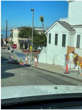
12th Street heading west