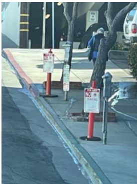
12th Street heading east