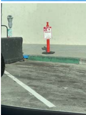
MBB/Man Ave NW corner