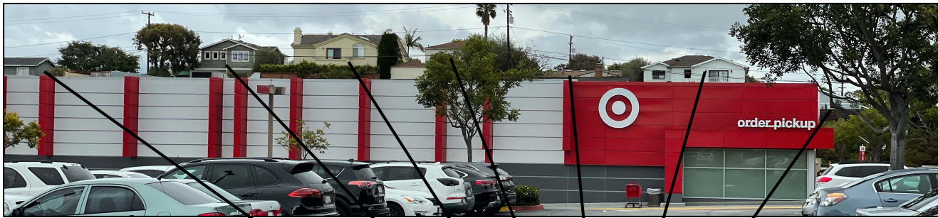
Left: View looking East towards Magnolia Ave from Target lot location for Containers as shown in “site plan sketch” below