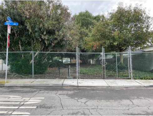
6 th and Aviation