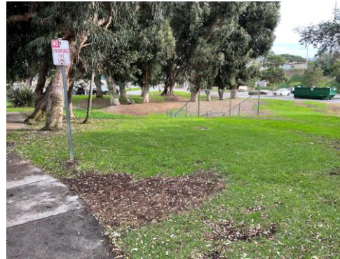
MBUSD Admin Building