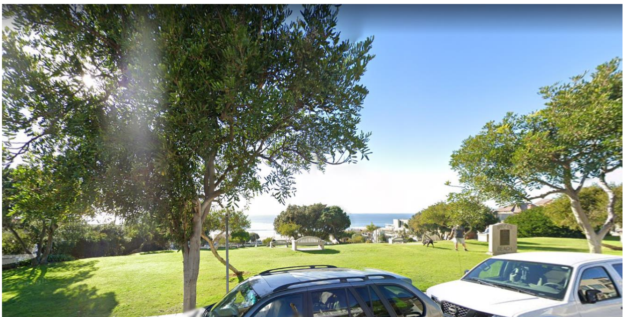
Bruce's Beach Park as viewed from Highland Ave.