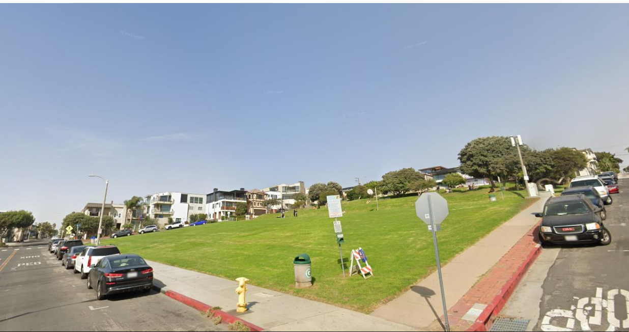
Bruce’s Beach Park as viewed from Manhattan Ave. and 26 th St.