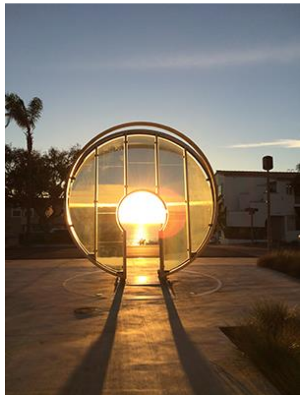
Light Gate , installed by the City of Manhattan Beach in 2014. This interactive artwork provides a view of the setting sun directly through the center of the keyhole twice a year.

This project is open to all professional artists and artist teams (here referred to collectively as "artist") with public art experience, ages 21 and older, who demonstrate the ability to complete a project of this magnitude. Eligible applicants must have successfully completed a commissioned large scale public or