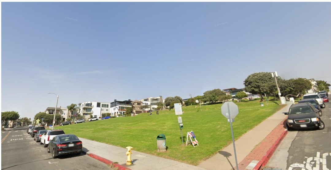
Bruce's Beach Park as viewed from Manhattan Ave. and 26 th St.