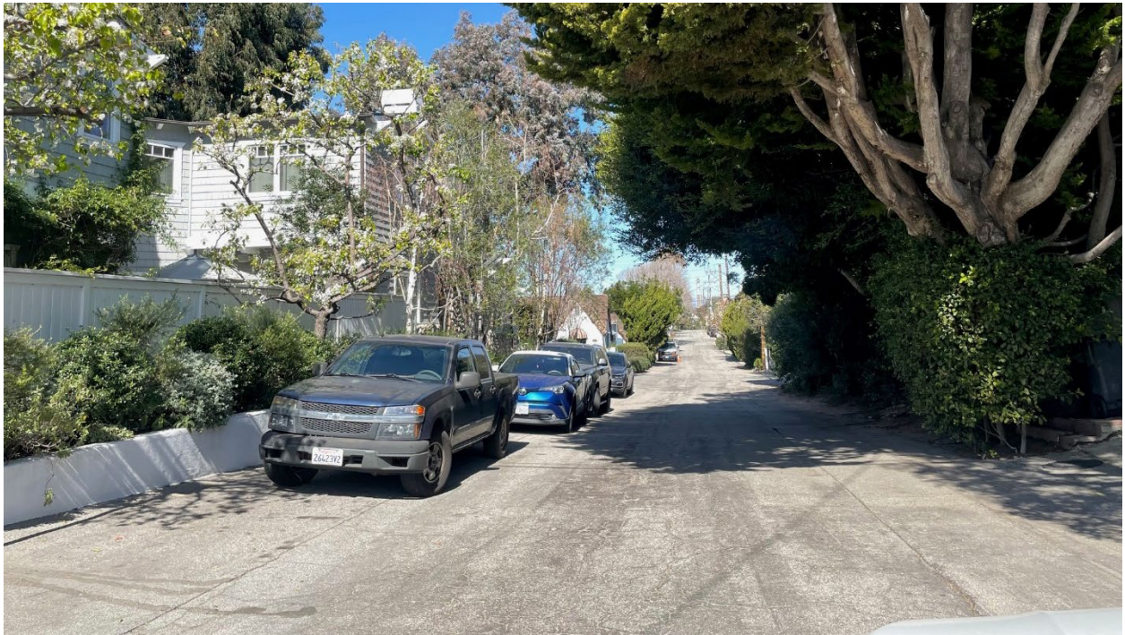
Flournoy Road at 33 rd Street Looking North