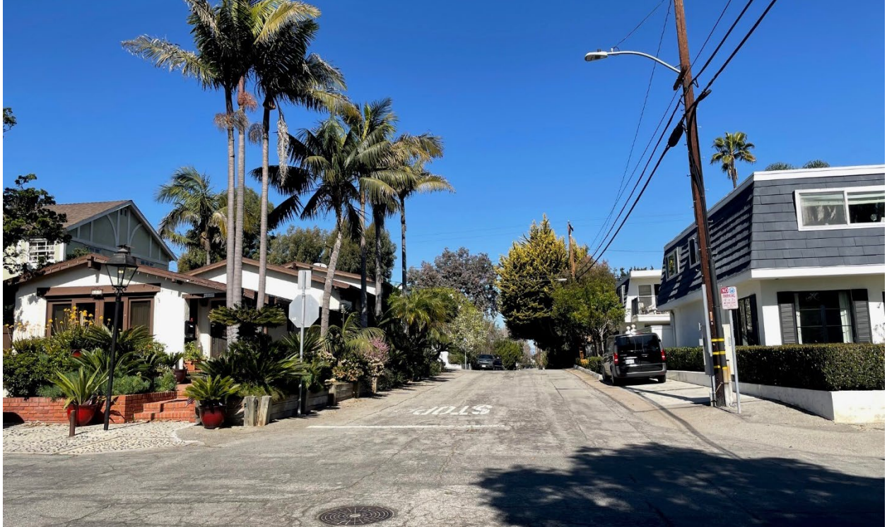
Flournoy Road at 31 st Street Looking North