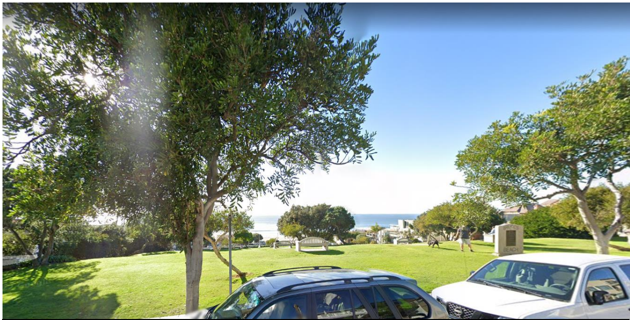
Bruce's Beach Park as viewed from Highland Ave.

The artist must prepare and submit a budget capturing all costs associated with the project using the Budget Sheet provided.