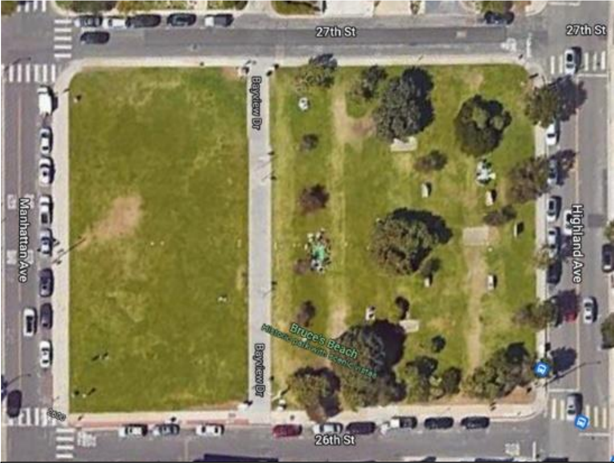
Aerial view of Bruce's Beach Park

The proposed artwork must take into account the size, location, topography, and current use of the park. The artwork may consist of one or multiple elements, may incorporate the new plaque and surrounding concrete pad*, and may be located anywhere in the park, so long as it meets all Americans with Disabilities Act (ADA) and other access requirements.** The artwork must present an educational and historical view of the events that led to this day and have strong Diversity, Equity, and Inclusion ties.