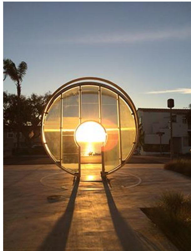
Light Gate , installed by the City of Manhattan Beach in 2014. This interactive artwork provides a view of the setting sun directly through the center of the keyhole twice a year.

This project is open to all professional artists and artist teams (here referred to collectively as “artist”) with public art experience, ages 21 and older, who demonstrate the ability to complete a project of this