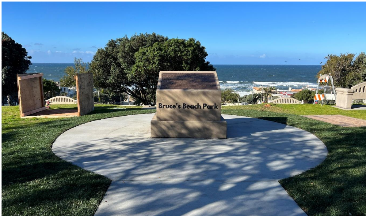
Rendering of new plaque location and surrounding concrete pad Concrete plaza measures 17' in diameter and is set 6' from the pedestrian sidewalk

The submission must include a maintenance plan for the artwork including the cost of repairing or replacing damaged parts of the artwork.