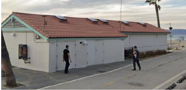
Street and the Strand STIPEND $20-30K