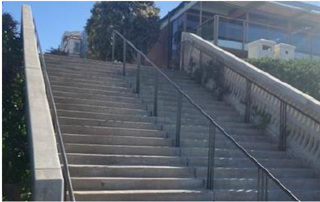
15th Street & Valley Drive – Fire Station 1 – North Facing Wall STIPEND $75-80K