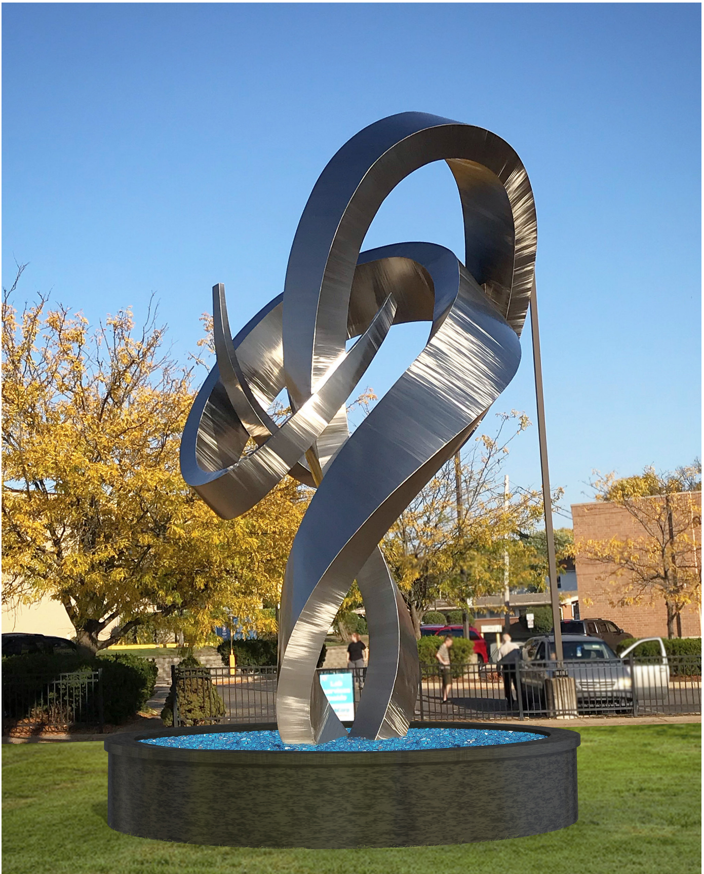
Title: Embrace Material: Marine-Grade Stainless-Steel Scale: 25'H x 16'W x 16'D Location: Hamilton, Ohio Commissioned by: City of Sculpture Budget: $250,000.00 Year: 2020