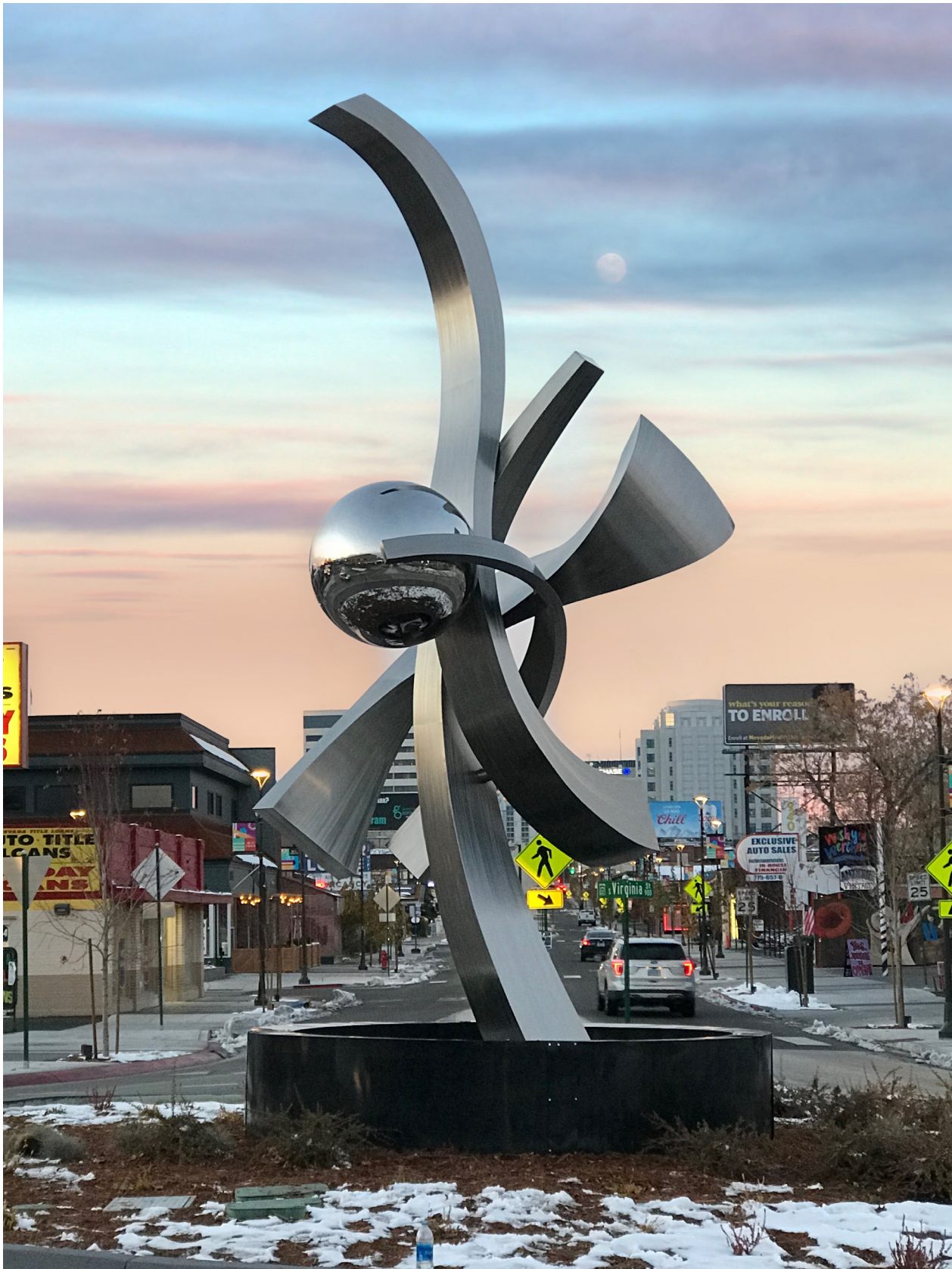
Title: Reciprocity Medium: Marine-Grade Stainless-Steel Scale 30'H x 16'W x 12'D Location: Reno, Nevada Commissioned by: City of Reno Budget: $200,000.00 Year: 2020