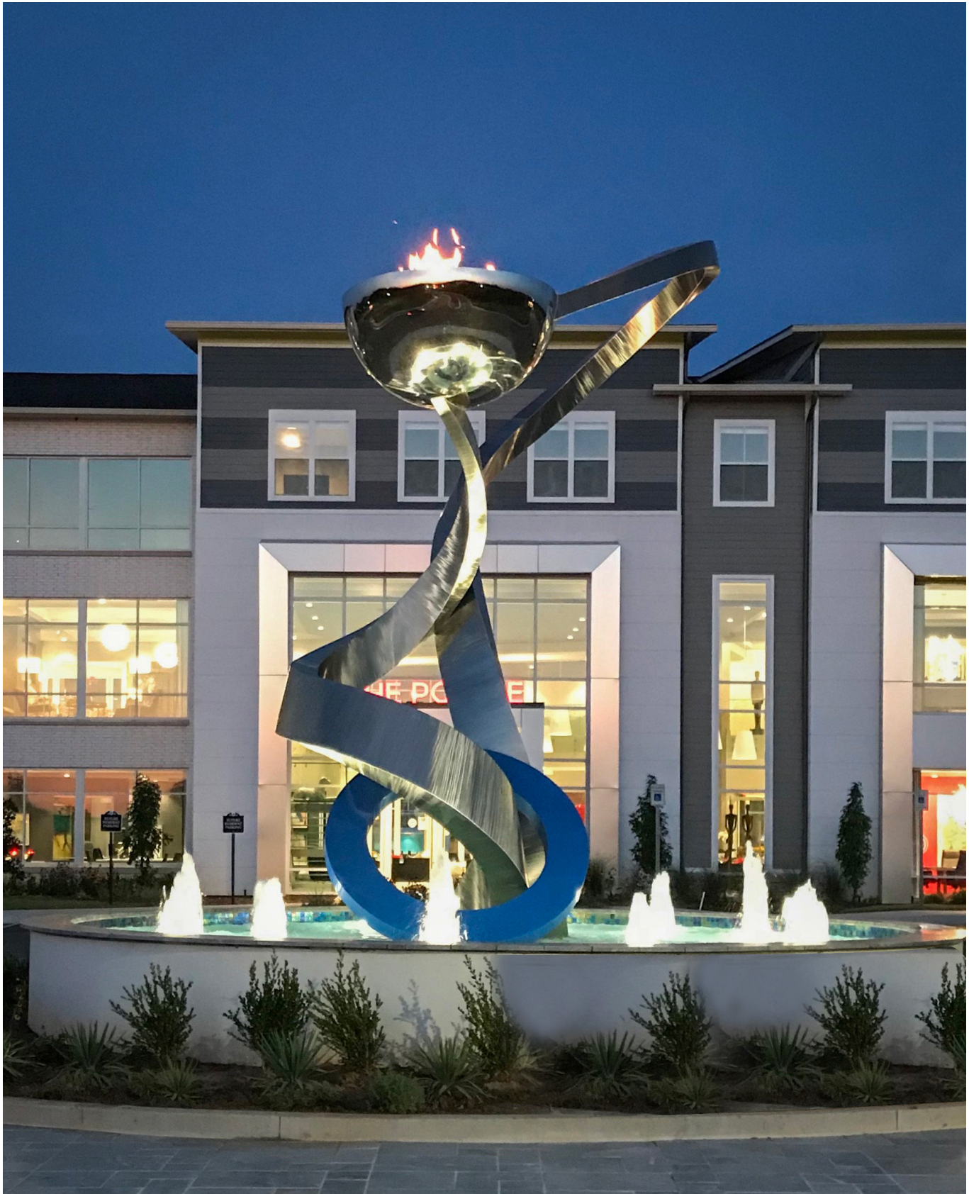
Title: Stellar Material: Marine-Grade Stainless-Steel Scale: 25'H x 15'W x 13'D Location: Little Rock, Arkansas Commissioned by: RichSmith Developers Budget: $150,000.00 Year: 2020