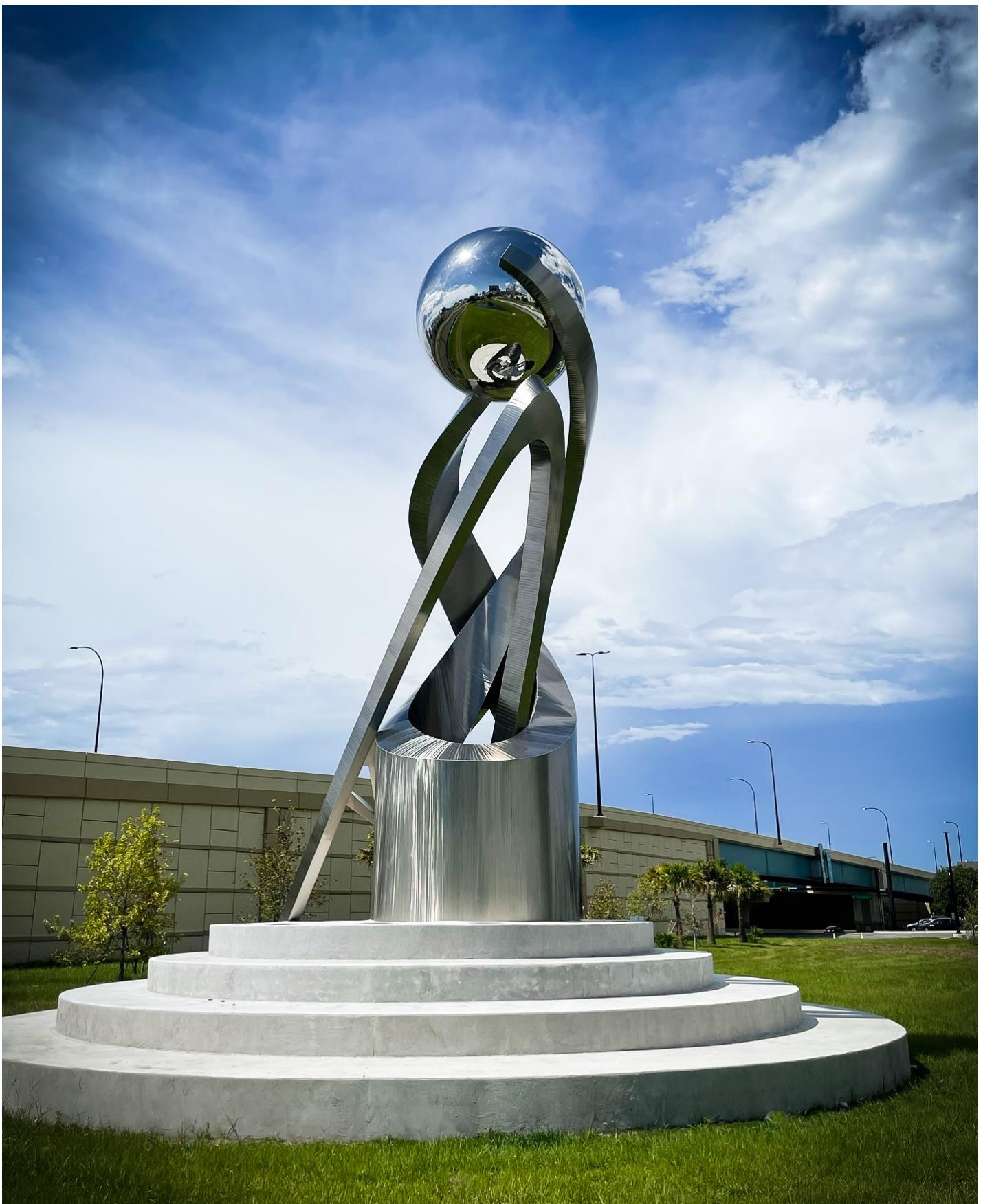
Title: Solidarity Material: Marine-Grade Stainless-Steel Scale: 40'Hx 16'W x 17'D Location: Orlando, Florida Commissioned by: City of Orlando Budget: $400,000.00 Year: 2022