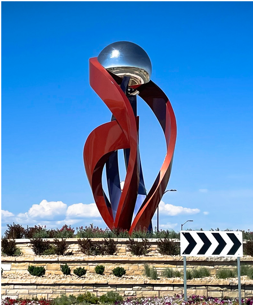
Title: Life Blood Material: Automotive Finished Stainless-Steel Scale: 28'H x 16'W x 15'D Location: Aurora, Colorado Comissioned by: The Aurora Highlands Budget: $300,000.00 Year: 2022