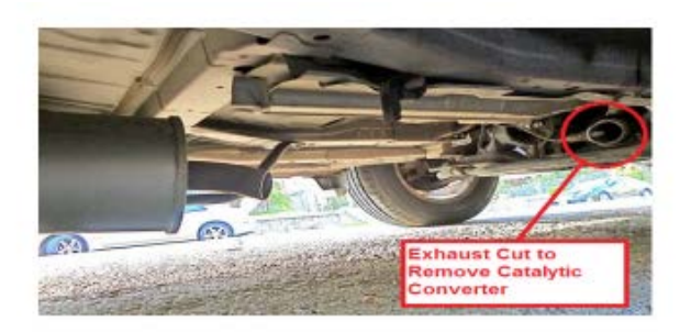
Prevention Tips on the Reverse Side

You'll notice a loud rumbling or roaring sound as soon as you turn on the engine if your catalytic converter is missing. This gets louder when you hit the gas. The exhaust is not working properly, so the vehicle also drives rougher than usual, often with a sense of sputtering as you change speed. Go to the back of the car and look underneath. The catalytic converter is a round canister that connects two pieces of piping in the exhaust. You will see a gaping space in the middle of your exhaust if the converter is missing, and you will likely see signs of the piping being cut away.