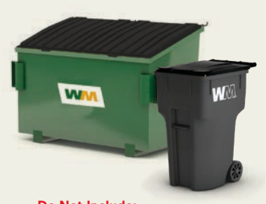
Do Not Include:

Organics/Recyclables Hazardous Waste Electronics & CFL Bulbs Batteries, Tires or Paint Flammable Material