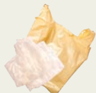
Plastic Bags & Film