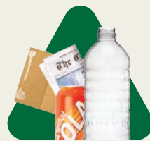
Recycle empty and dry bottles, cans, paper and cardboard.

Remember these three simple rules each time you recycle: