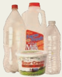
Plastic Bottles & Containers