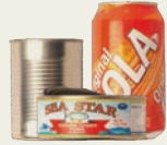
Food & Beverage Cans