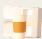
Foam Cups & Containers