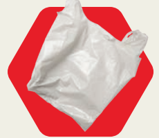
No loose plastic bags and no bagged recyclables.

To learn more about what goes in your recycling container, see page 4 of this newsletter.