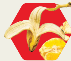
Keep food and liquid out of your recycling.