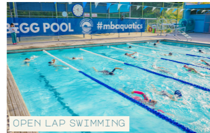
OPEN LAP SWIMMING

Local team sports can serve as a unifying force for community. We would love to hear about your involvement in any local team sports, or your interest in seeing a particular new aquatic sport supported at the new facility.