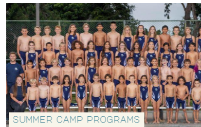
SUMMER CAMP PROGRAMS