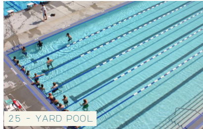
25 - YARD POOL

Two different pool sizes can offer a variety of community programs and options for different swim levels, including the flexibility to run multiple programs at the same time. Our table host tonight will walk you through the different activities a 25Y and 35M pool can offer.