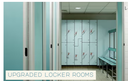
UPGRADED LOCKER ROOMS