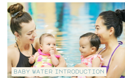
BABY WATER INTRODUCTION

A well-designed pool facility becomes a hub of learning and a center for promoting community well-being. Currently, the City and Manhattan Beach USD offer a variety of education, wellness, and water safety programs for different age groups. Are there any classes that you or your family would like to participate in that are currently not offered?