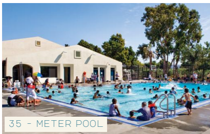
35 - METER POOL