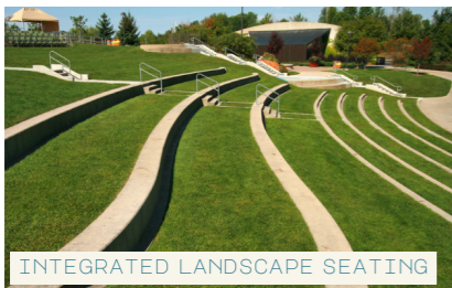
INTEGRATED LANDSCAPE SEATING

When visiting the current Begg facility, are there any exterior amenities that you wish were offered, such as secured outdoor lockers, deck showers, or more seating areas? Are there amenities that could directly support the needs of the programs and classes offered?