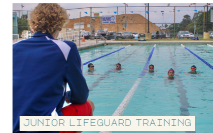
JUNIOR LIFEGUARD TRAINING