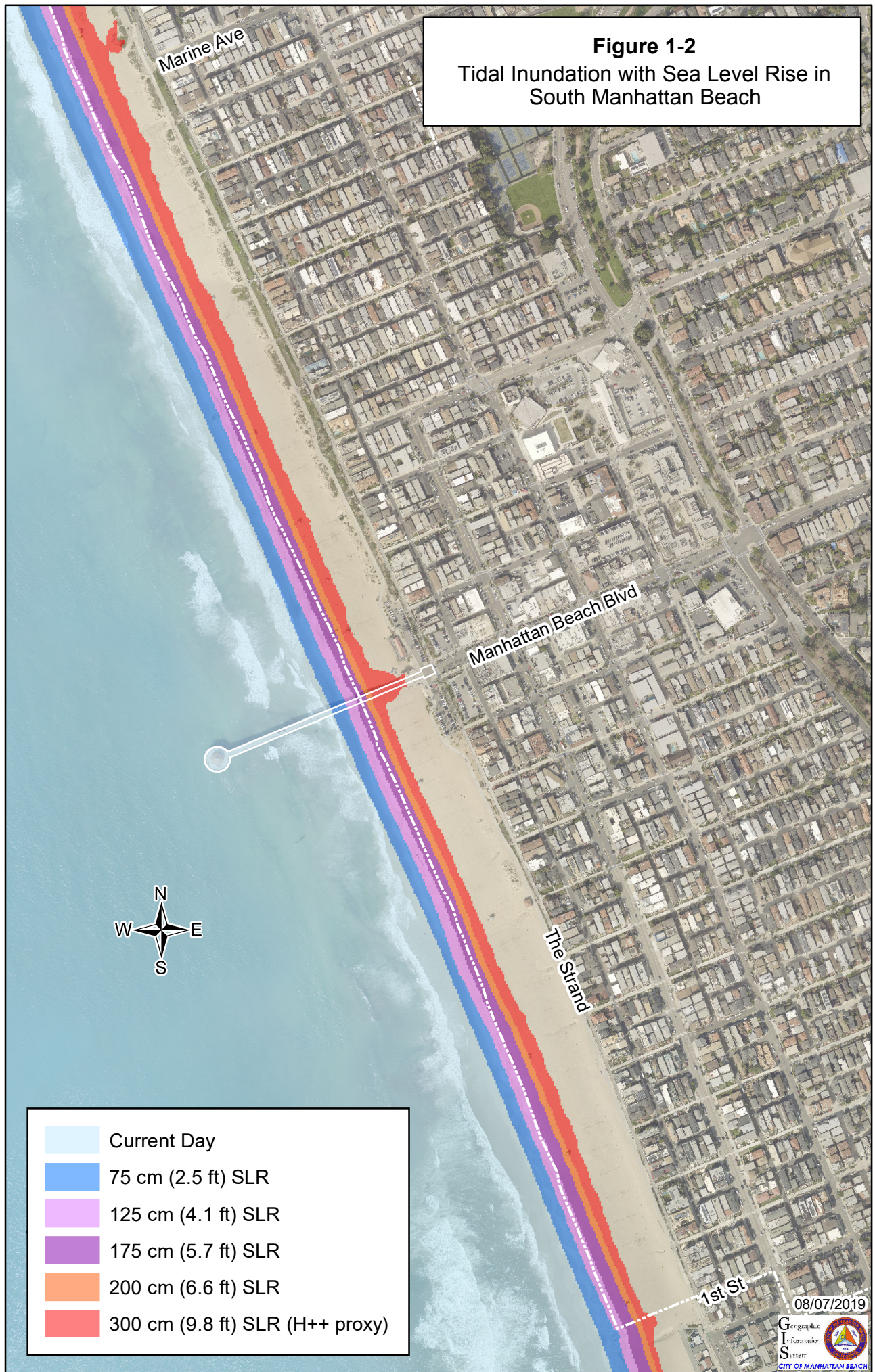
Figure 1-2 Tidal Inundation with Sea Level Rise in South Manhattan Beach