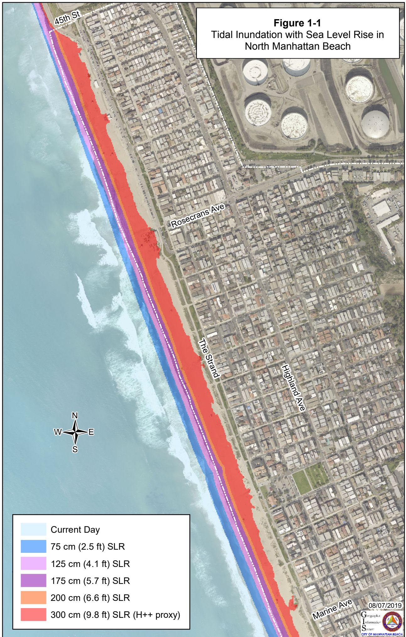
Figure 1-1 Tidal Inundation with Sea Level Rise in North Manhattan Beach