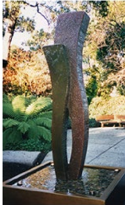
Back Together bronze 90 x 48 x 48 in