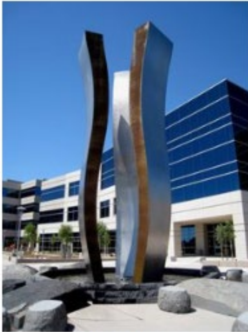
Three Waves mixed metals 144 x 50 x 50 in

"Note: This PowerPoint presentation is intended solely as a visual aid to an oral staff presentation of an agenda report topic. In the event of any differences between the presentation and the agenda report, the information in the agenda report prevails."