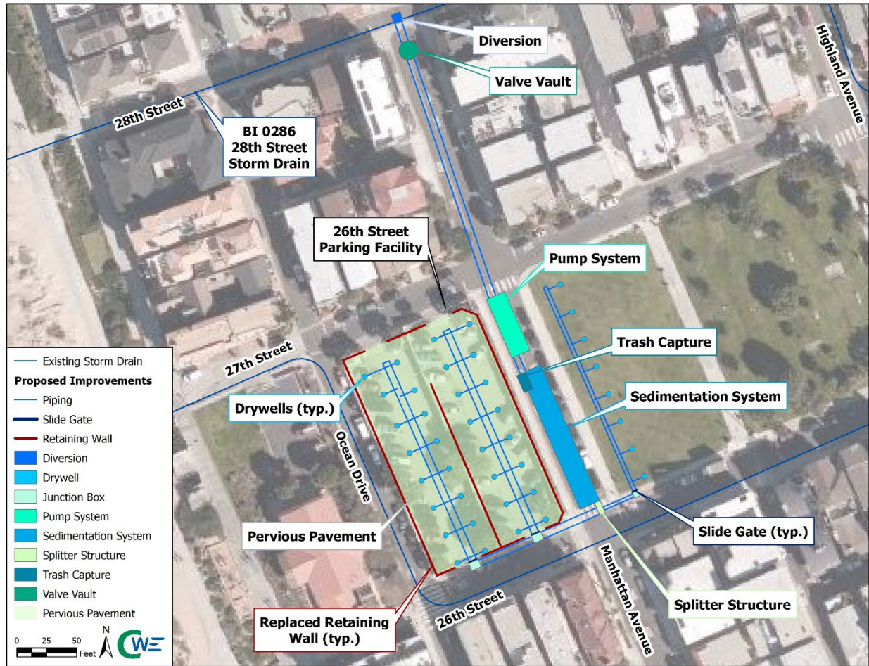
Figure 2-3 Stormwater Infiltration Concept