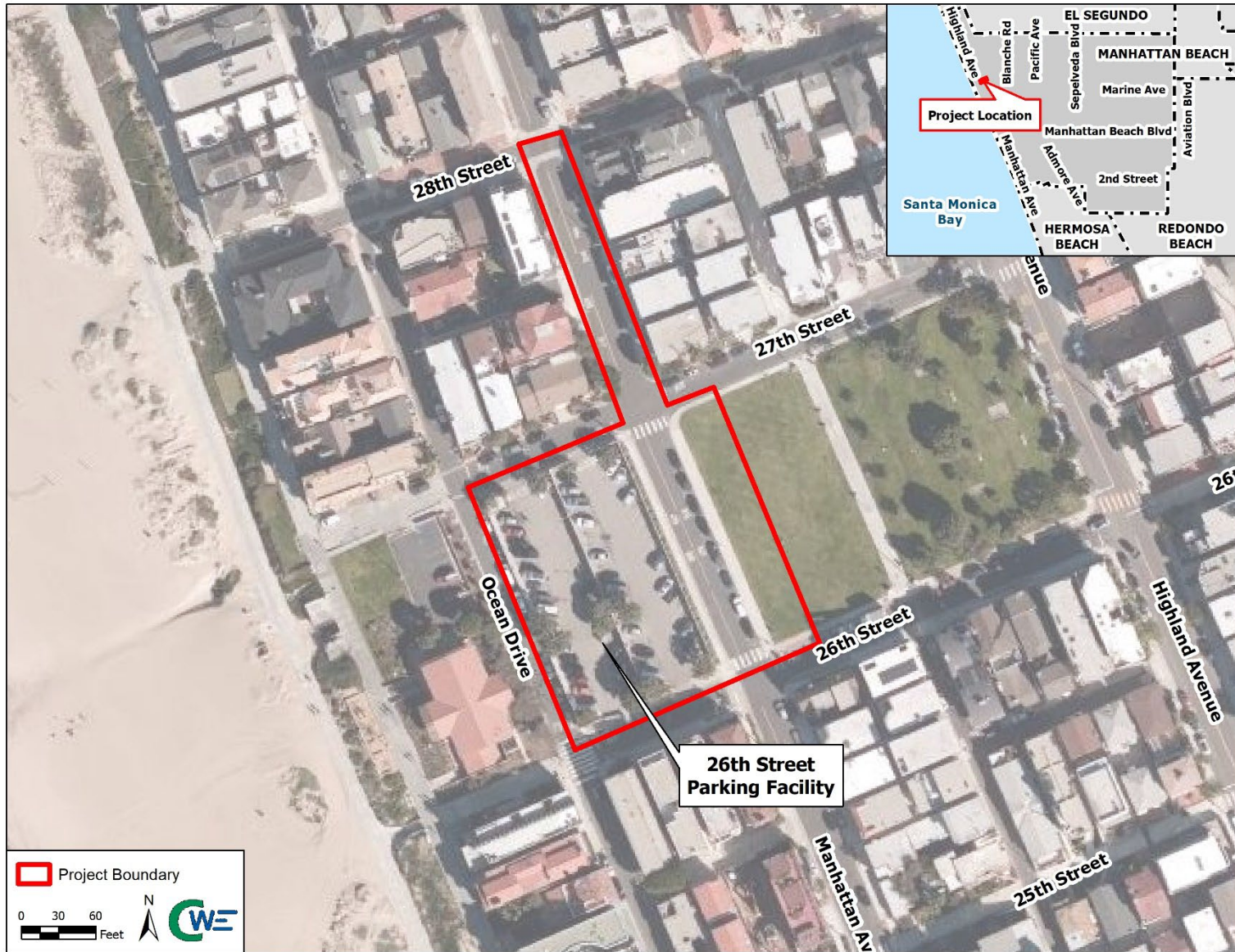
Figure 2-2 Project Location