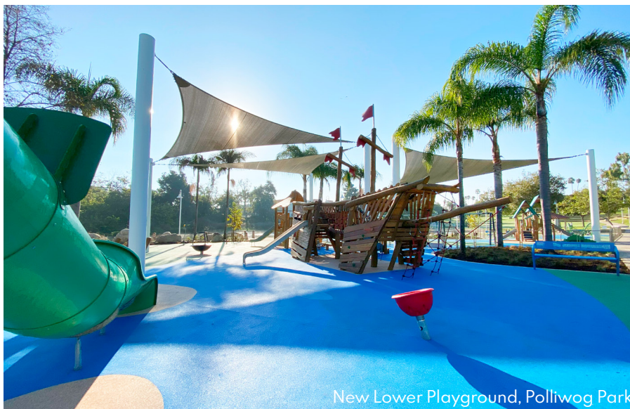
New Lower Playground, Polliwog Park

(a) State of California, Department of Finance, E-1 Population Estimates for Cities, Counties and the State with Annual Percent Change — January 1, 2023 and 2024. Sacramento, California, May 2024.