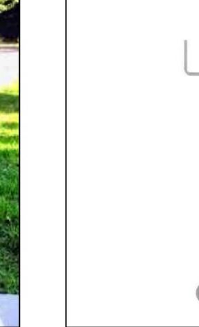
Pet Rinse Station with Hose/Leash Hook