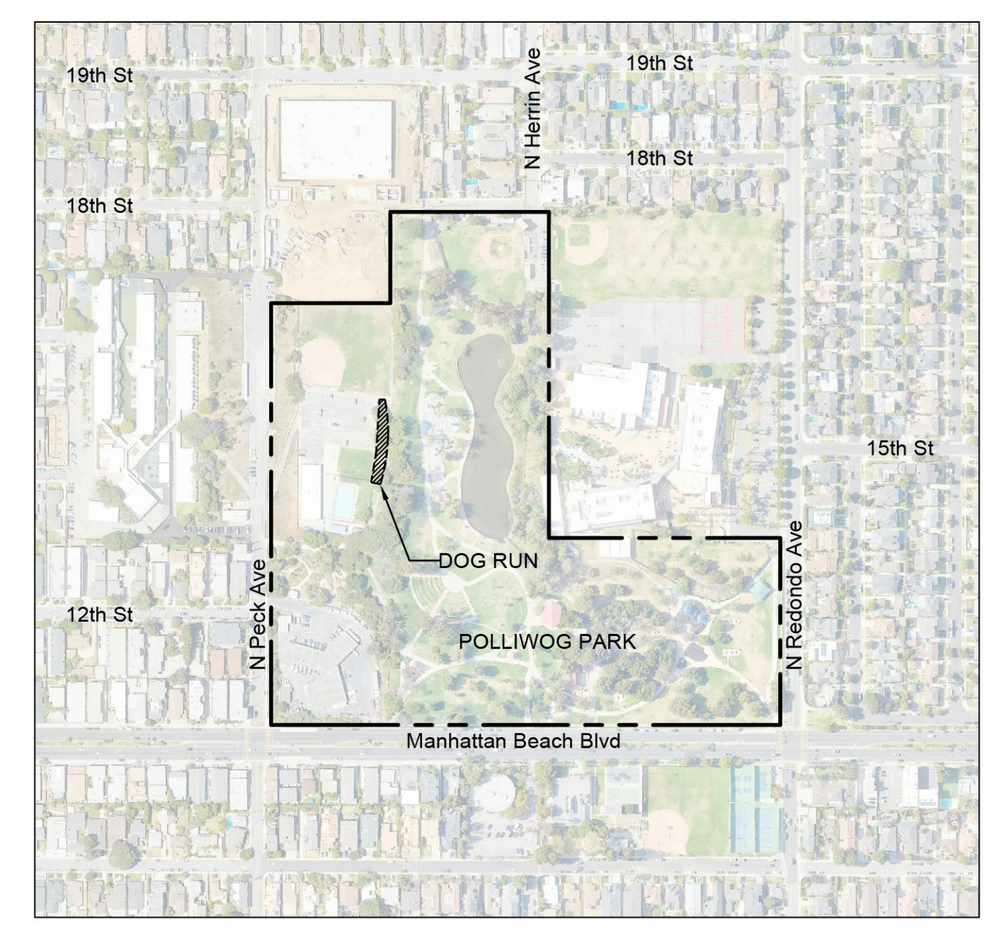
VICINITY MAP NTS

The new and improved Polliwog Park Dog Run will be a great amenity for the community. With the proposed features shown here, the space will be both beautiful and fun!