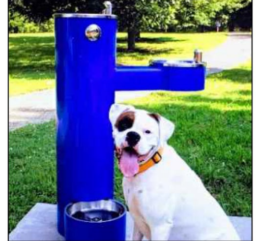
Drinking Fountain with Pet Bowl