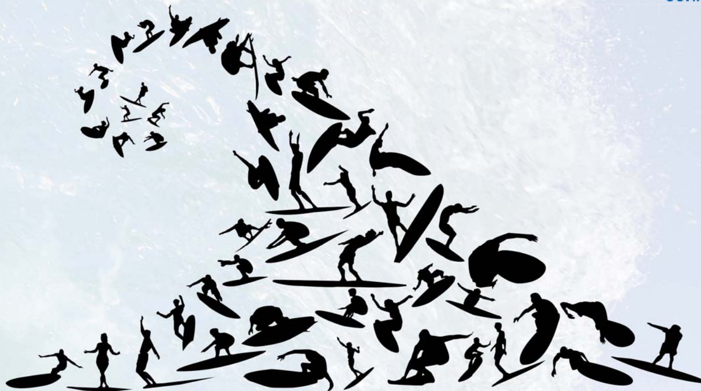
Wave Surfers